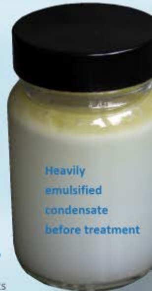
Heavily emulsified condensate before treatment

Stable emulsions present a challenge to any oil/water separator, but STERLING ® Active Filter units are up to the job. With an active biological component that actually digests oil, the CSR 'AF' range is the answer to problem condensates