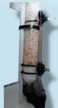
Filter media on test in the STERLING ® laboratory