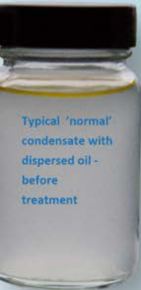
Typical 'normal' condensate with dispersed oil - before treatment

The STERLING ® CSR separator is designed to clean 'normal' dispersed condensates from almost all compressor systems that run on mineral or mineral-based lubricants - giving outlet quality of better than 20ppm from installation through to end-of-life. That's up to 4000 running hours